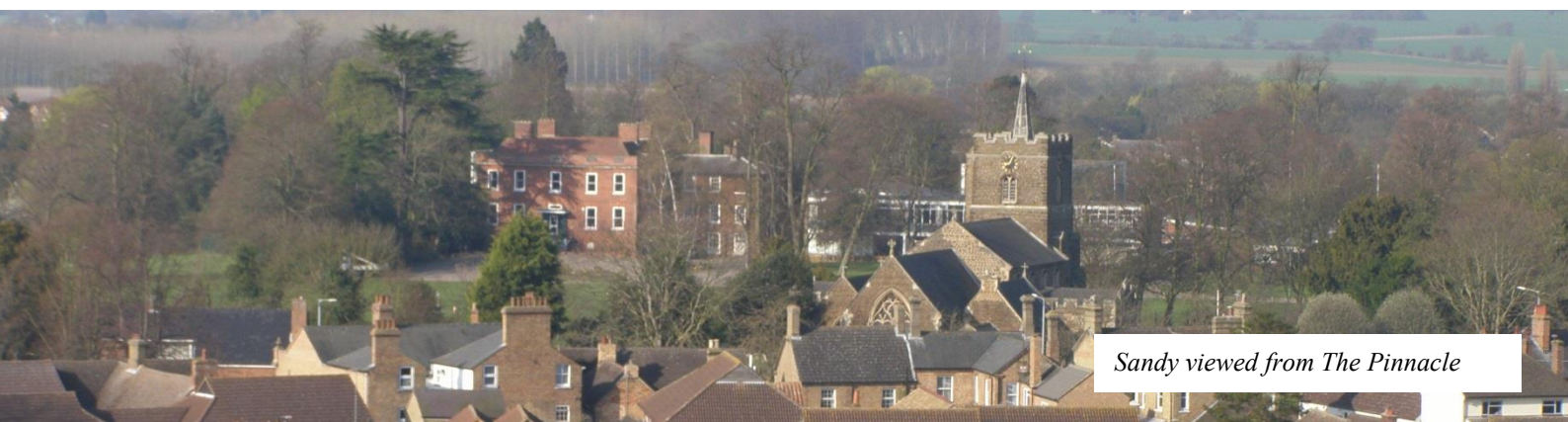
Sandy viewed from The Pinnacle

In addition therefore to its role set out above, with news still awaited regarding the route of the proposed new East West Rail link, studies still ongoing regarding the future of the A1 and the present consultation regarding the A428 Black Cat to Caxton Gibbett improvements it will be important for this committee and indeed the Town Council as a whole to remain diligent and to try to ensure there is co-ordinated planning to help influence the way Sandy develops during the decade to come and beyond.