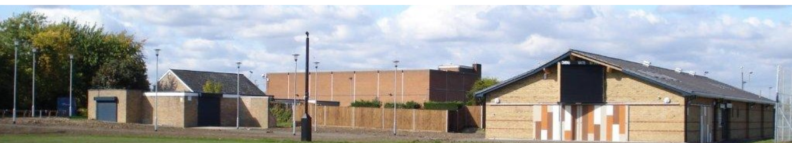
The Jenkins Pavilion at Sunderland Recreation Ground

The council continued to provide free public car parking in the town centre car park with the aim of supporting local businesses. The car park includes public conveniences which are owned and operated by the town council as are the public conveniences at Bedford Road Recreation Ground.