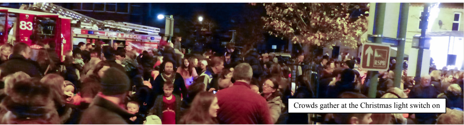
Crowds gather at the Christmas light switch on

Despite this, the event was judged another real success. Good numbers turned up, though not as many as the previous year, there was a full programme of stage events and Santa Claus was overwhelmed by the number of expectant children. Stalls of all kinds were very well received and the public generally felt that the lights themselves were a step up from the previous year. Almost all the feedback was positive and we look forward to a similar event in 2016.