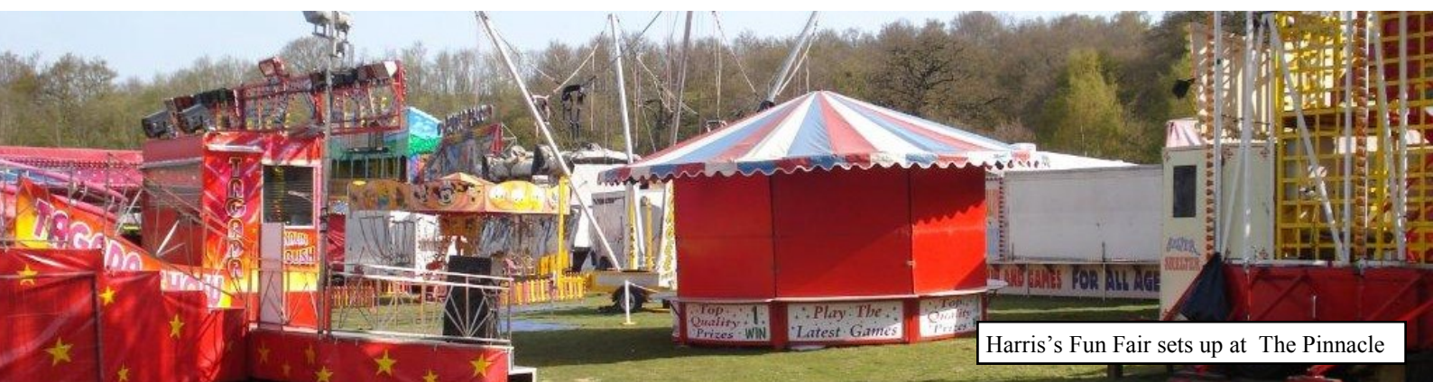
Harris's Fun Fair sets up at The Pinnacle