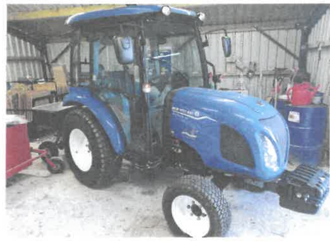
A GPMF grant enabled the club to buy a Boomer tractor

Additional secondary drainage has also been added to pitches one to four, and the club is considering extending drainage to pitches five to