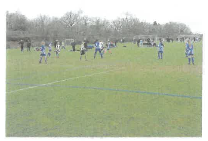
More than 700 girls and boys now enjoy football at the site

pitch drainage for the mini pitches and the requirement of a more powerful tractor and deep aerator.