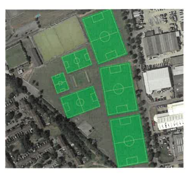
Date submitted 17/03/22

Many thanks to the local authority for their patience in waiting for the report to be completed while the upgrades to PitchPower took place. Please be mindful that the recommendations made in this report are based on the condition of the pitches at the time of the inspection back in March. Grass coverage was variable depending on the pitch, worn in places but good in others with some weed coverage in areas but generally limited across the site. Grass