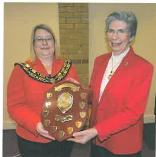
Figure 2 Presentation of Mayor's Community Award