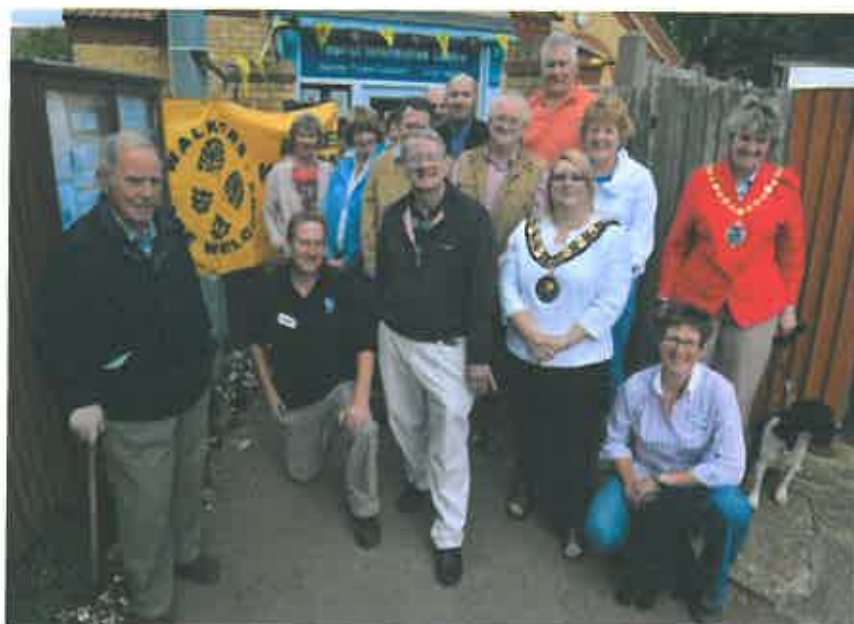
Figure 6 Walkers are Welcome Launch Event

A series of guided walks and talks have been provided through the year by the Tourism Advisers. The Advisers also worked hard with other Sandy Town Council officers and members of the community to help secure Walkers are Welcome status for Sandy. Sandy is the first community in Bedfordshire to secure Walkers are Welcome accreditation which was awarded in July 2012 following a successful community led campaign. The award was celebrated with a special walk and celebratory cake.