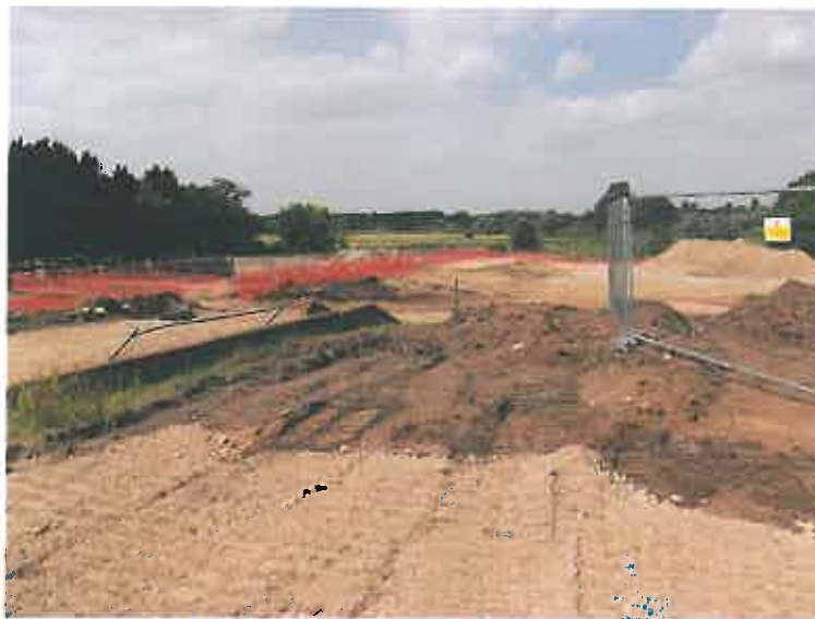
Figure 8 Preparation for building at Tesco site, New Road

The Development Scrutiny Committee also responded to planning consultations on behalf of the Town Council including consultations on documents which go to make up the suite of documents which form the Central Bedfordshire Local Development Framework for the North.