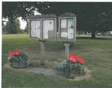
Figure 4 Beeston Common

Beeston Green is an important area of common land which is owned by the Town Council and maintained for the community.