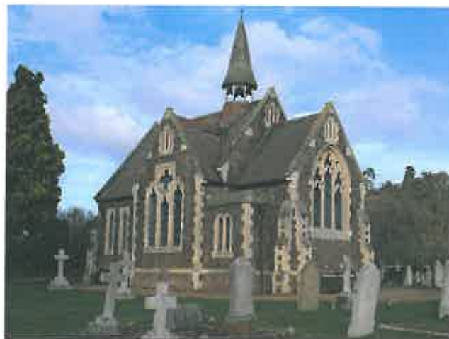
Figure 3 Cemetery Chapel

It is planned to extend the cemetery on the land currently used for allotments during the next few years. Studies of soil contamination levels have been commenced this year and further work will be necessary once the site has been vacated and allowed to settle. Archaeological and ecological surveys will be necessary before development work can begin. Meanwhile capacity in the cemetery is reducing though if burials continue at the present rate will suffice for several years.