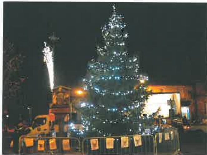
Figure 5 Christmas Tree in the Market Square

Sandy Town Council took over provision of the Christmas 2012 illuminations as the Sandy Chamber of Trade felt unable to continue this work. The old illuminations donated to the Council by the Chamber of Trade did not pass our safety tests and so could not be reused, resold or donated. New illuminations were hired from a contractor on a three year contract and a Christmas tree was introduced into the Market Square. Investment in safe and appropriate infrastructure was necessary and it is hoped to build upon this in future years. A lights switch on event was organised by the Town Council with support from many local organisations and businesses and was well attended. One of the goals for this event was to allow local organisations and charitable groups to showcase their activities and raise funds for themselves. It is planned to repeat the event in 2013.