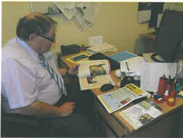
Figure 1 Councillor at work

The Town Council is supported by a team of 12 staff (6 part-time and 6 full-time) who together have managed an increasing workload fuelled by changes to local government policy and legislation and increased expectation following the Localism Act 2011. The staff headcount has remained stable although the overall number of contracted hours worked by staff has been reduced during the year. The Council continues to look for improvements to its efficiency.